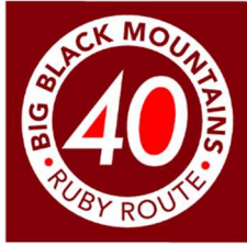
BBMC Ruby Route

Big Black Mountains Challenge, Longtown Mountain Rescue Team,