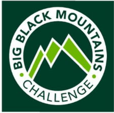
BBMC Traditional Routes